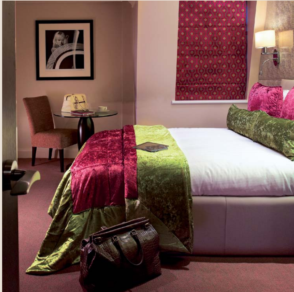
137 bedrooms are calming and comfortable, while interactive, all-in-one Apple technology brings your world to your TV screen.